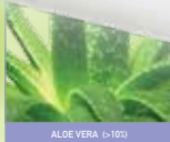
ALOE VERA (>10%)